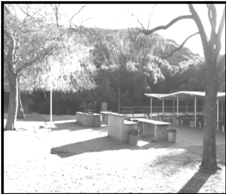
Oak Grove Park will be the site of the first VCCCDRA barbeque on Oct. 11.